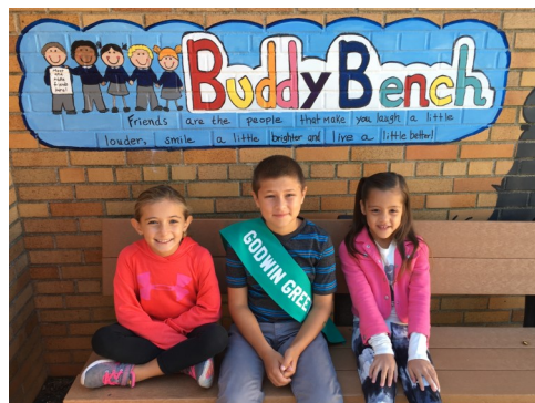
Godwin School Buddy Bench