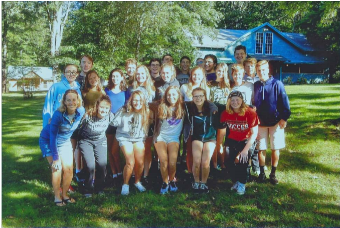
Midland Park Take Action Peer Leaders