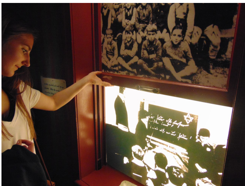
Holocaust Study Tour 2016