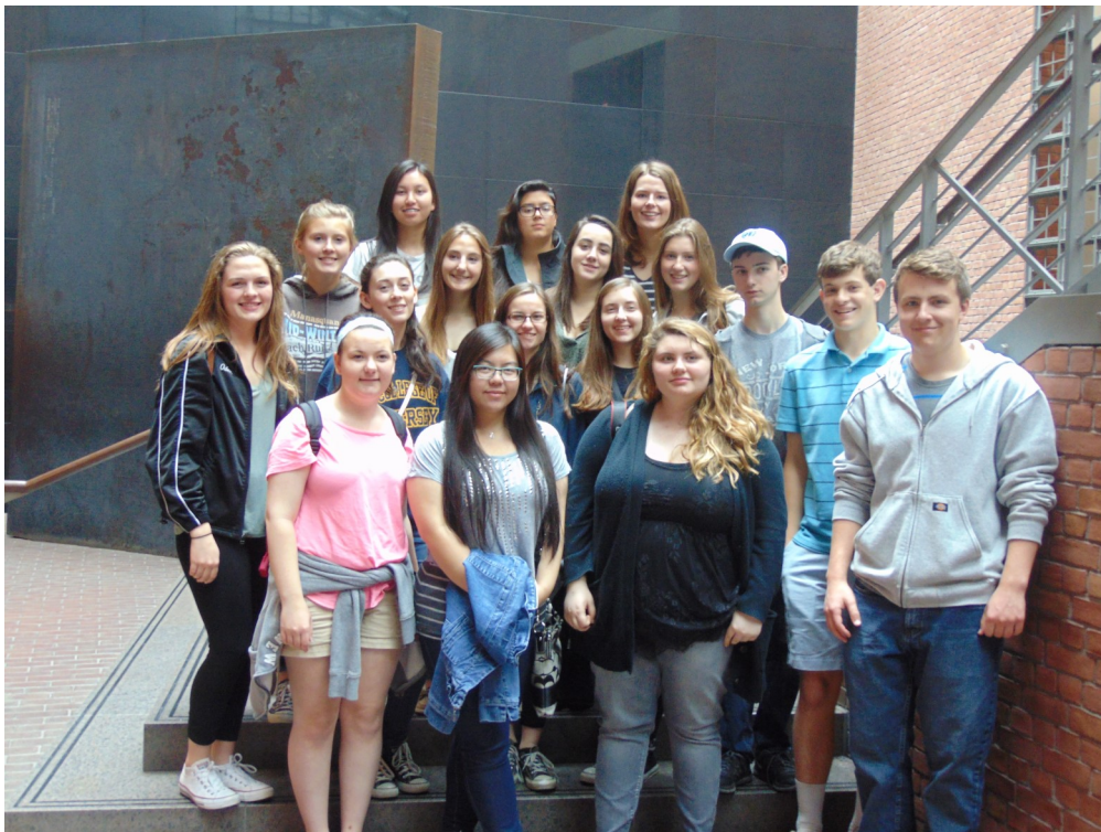
Current Seniors - Holocaust Study Tour 2016